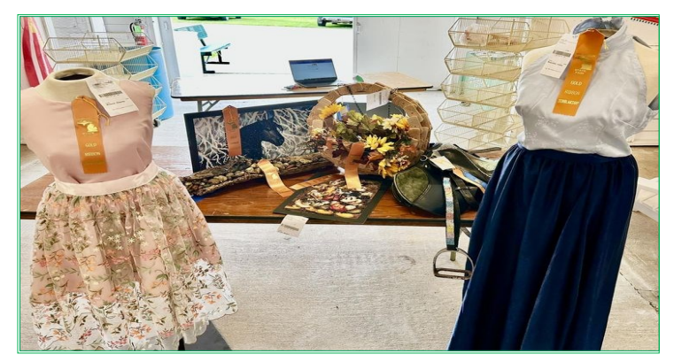
Gold Ribbon Awards for 4-H Still Projects