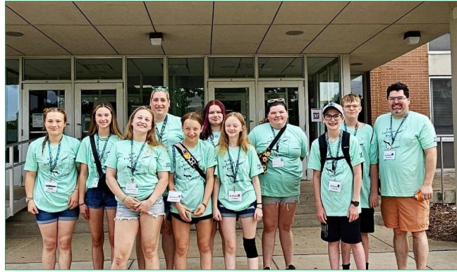
4-H Exploration Days youth & volunteers