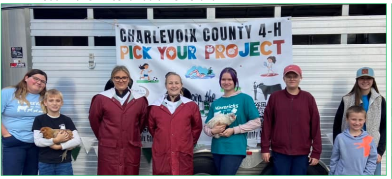
Maverick 4-H Club walking in the Homecoming parade in Charlevoix.