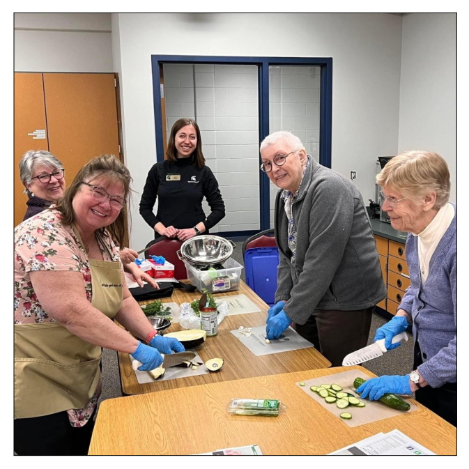
Friendship and Fun at the Charlevoix Senior Center

MSU Extension offers programming and resources for social-emotional and mental health, chronic disease and diabetes management, food safety and food preservation, developing heathy relationships, caregiving and parenting, nutrition and physical activity, and more.