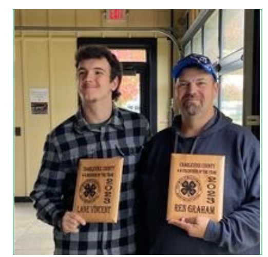
2024 Volunteers of the year: