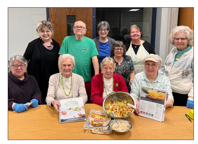
Cooking for one at the Charlevoix Senior Center