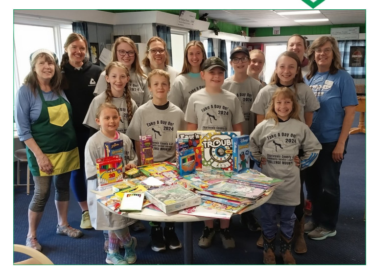
Take A Day On - Challenge Mountain

15 Youth, 5 Adults and 7 Swim School Staff