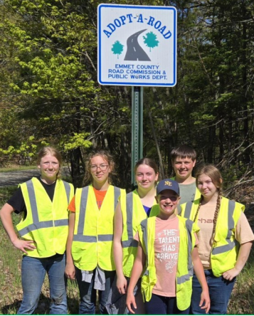
Maple River 4-H Club cleaning up the road.