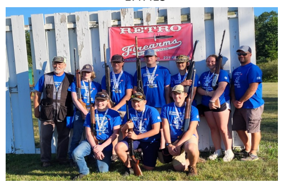
Shooting Sports attended the State Competition.