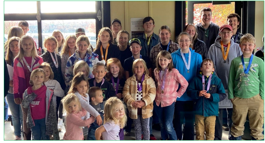
Celebrating the youth of Charlevoix County at their annual Recognition Banquet.